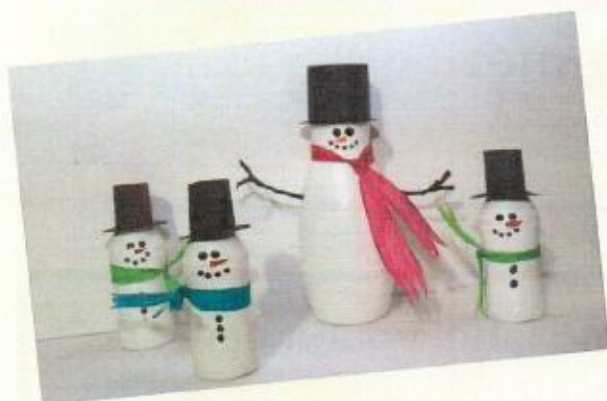
Empty yoghurt bottles

Make a snowman from recycled materials in your house. Be as creative as you like and use the below photos for inspiration. Keep evidence of your creations!