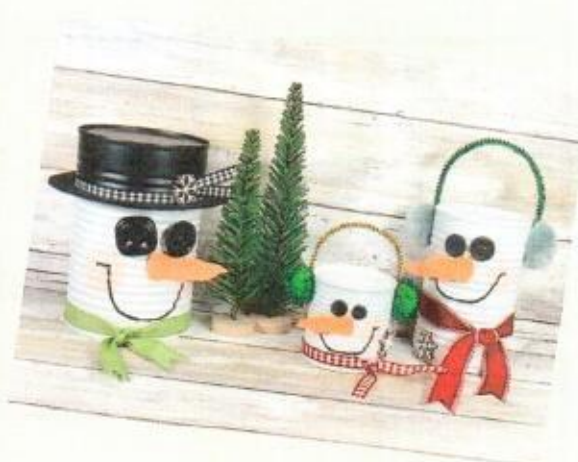
Old tin cans