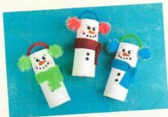
Toilet roll tubes