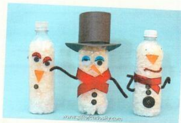
Re-purposed plastic bottles